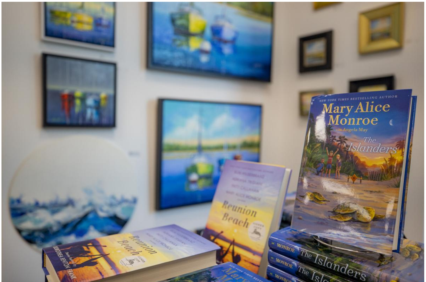
Bestselling author Mary Alice Monroe's book is on display at a book conversation in the art gallery of Wild Dunes Resort on Thursday, August 19, 2021, on Isle of Palms.