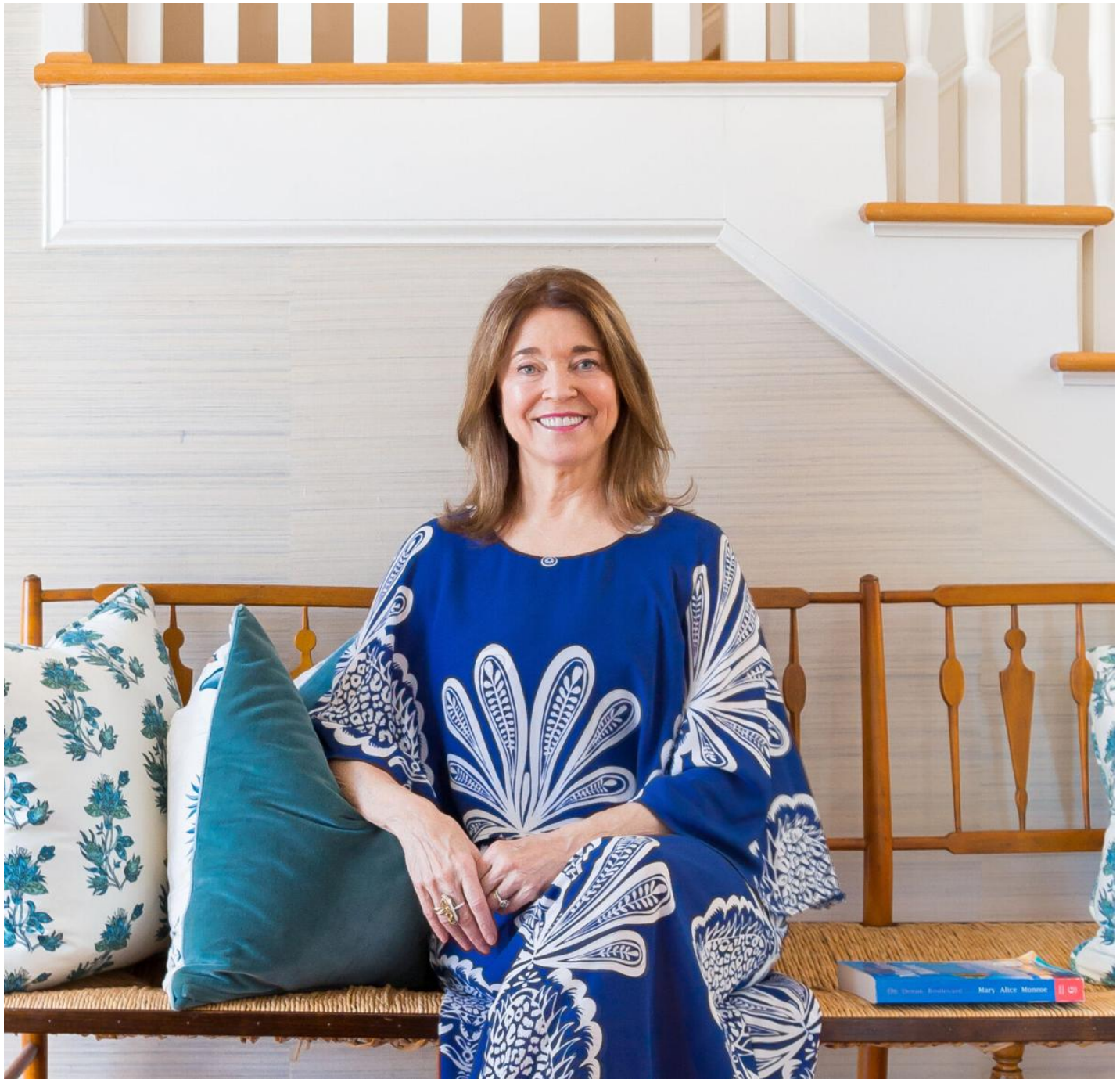
South Carolina's Mary Alice Monroe is the New York Times bestselling author of 27 books, including her latest novel, "The Summer of Lost and Found."