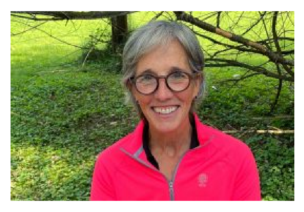
WHY YOU SHOULD JOIN A WRITING SALON